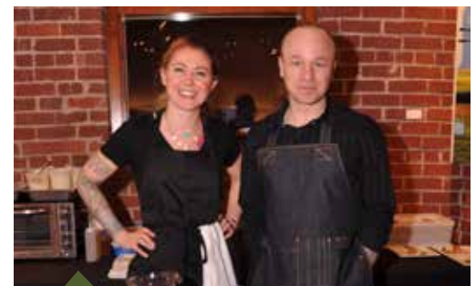
EDIBLE Allegheny Magazine's LIFT YOUR SPIRITS Event at James Gallery | 2-12-14

Social Media Get instant updates and information via social media outlets through Edible Allegheny's Twitter and Facebook feeds.